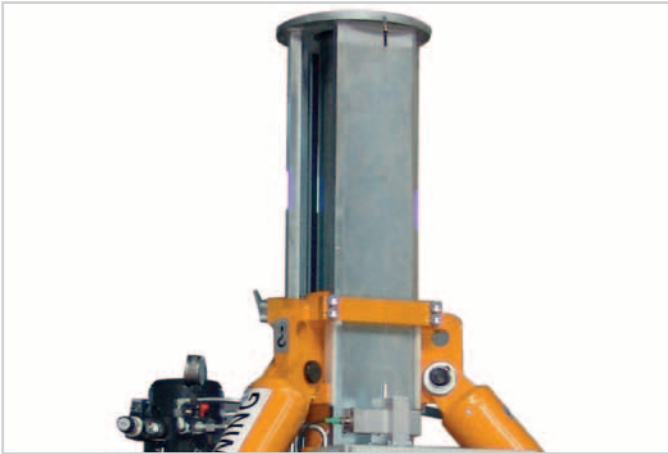
Low maintenance based on J-AMI JMS Automatic Mechanical INTERLOCK system