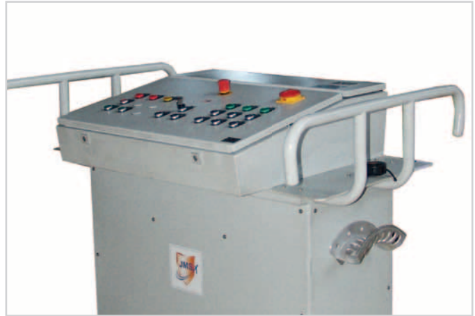
Most cost efficient operation based on J-SLS JMS Synchronized Lifting System

J M S . T H E N E W G E N E R A T I O N I N G S E .