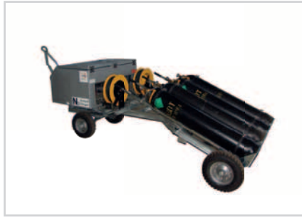
J-CART-4BN-BOOSTER, bottle trolley 4x Nitrogen