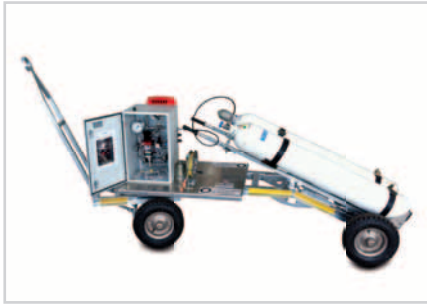
J-CART-2BO-BOOSTER, bottle trolley 2x Oxygen