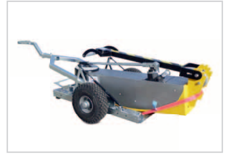
J-CART-A with 90 to. axle jack